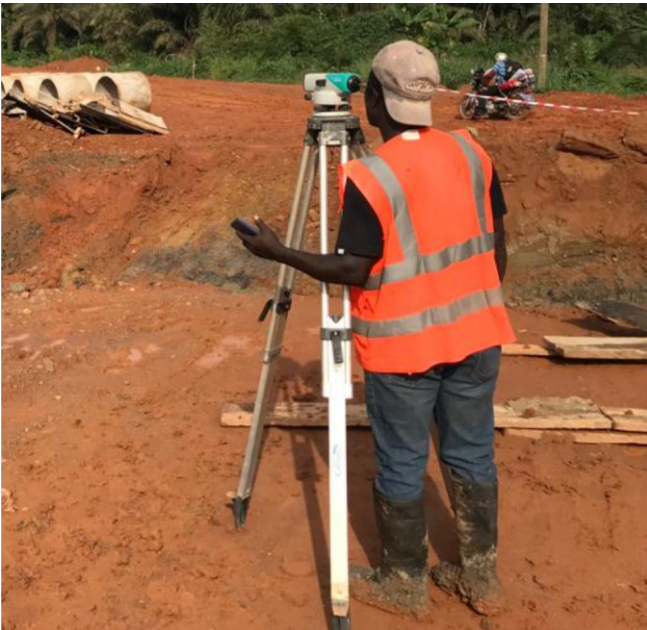
Description: Leveling Instrument Quantity: 3 no. Source: Own Condition: Very Good