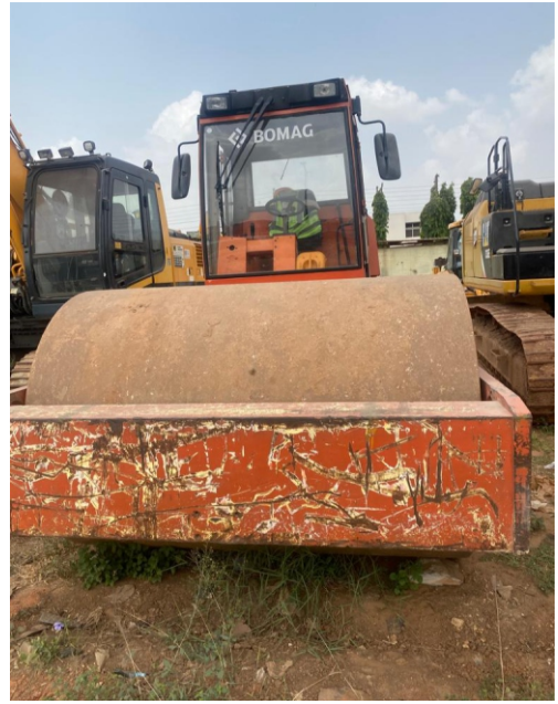
Description: Steel Roller Compactor (19 ton) Quantity: 5 no. Source: Own Condition: Very Good