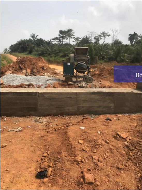
Box and Pipe Culverts