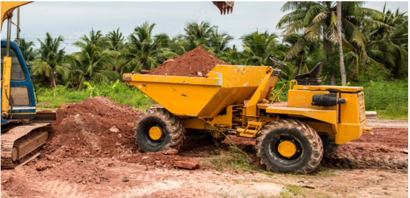
Description: Dumper Truck Quantity: 4 no. Source: Own Condition: Very Good