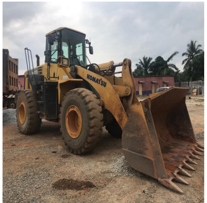
Description: Wheel Loader Quantity: 2no. Source: Own Condition: Very Good