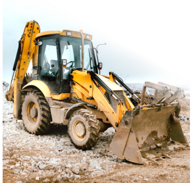
Description: Backhoe Quantity: 3 no. Source: Own Condition: Very Good