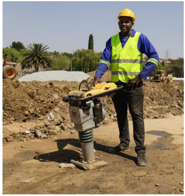
Description: Plate Compactor Quantity: 6 no. Source: Own Condition: Very Good