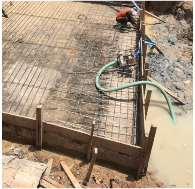
Description: Poker Vibrator Quantity: 6no. Source: Own Condition: Very Good