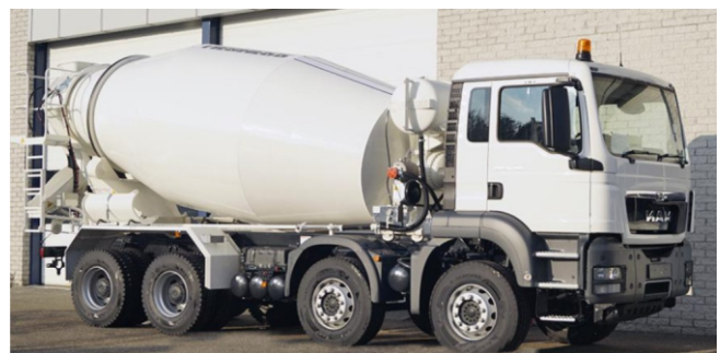
Description: Mobile Concrete Mixer Quantity: 3no. Source: Own Condition: Very Good