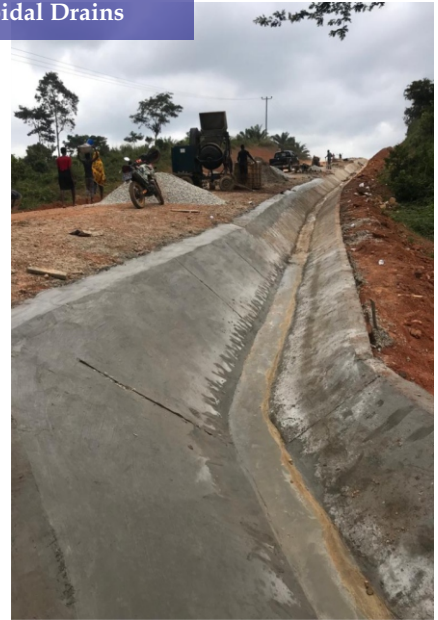
U & Trapezoidal Drains