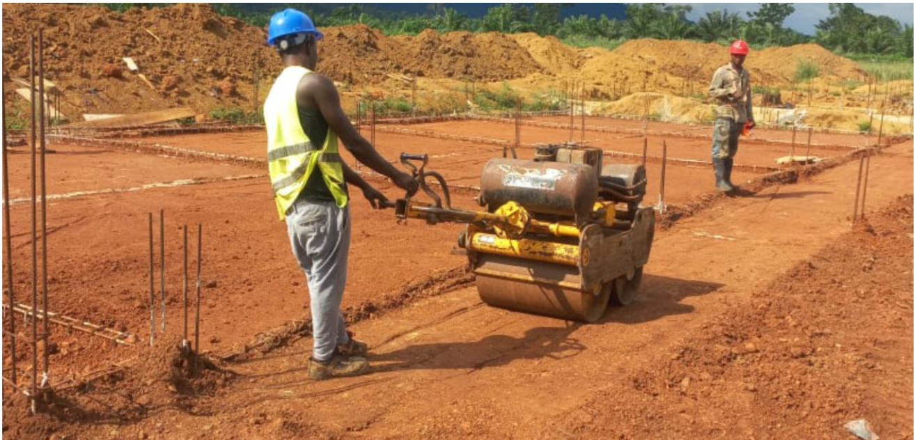
Description: Roller Compactor Quantity: 2no Source: Own Condition: Very Good