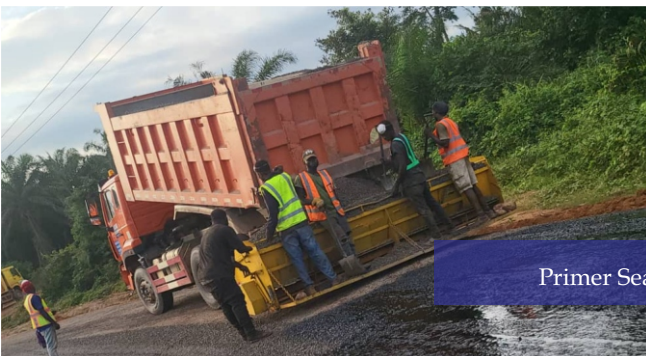
Primer Seal Works