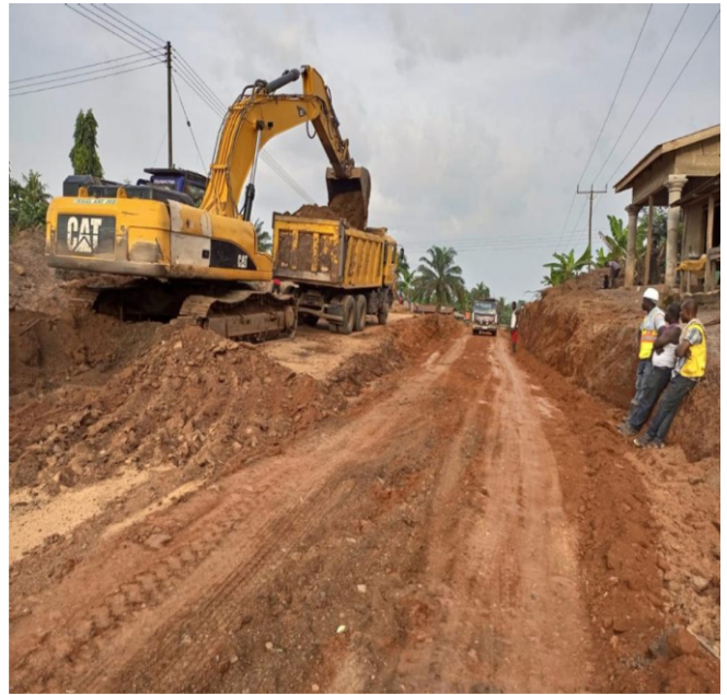
Description: Excavator Quantity: 2 no. Source: Own Condition: Very Good