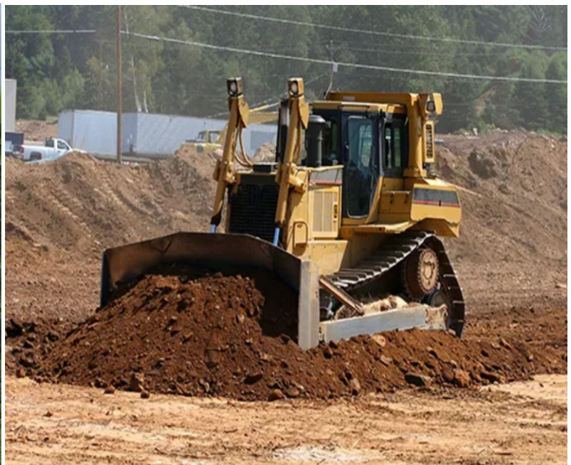
Description: Bulldozer Quantity: 2no. Source: Own Condition: Very Good