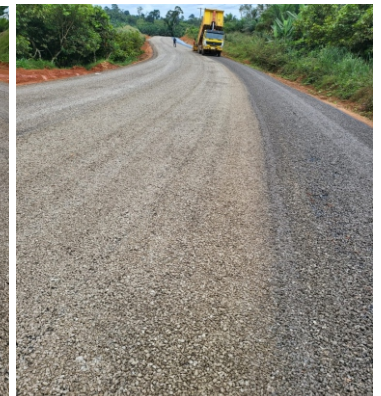
Sub Base and Base Works