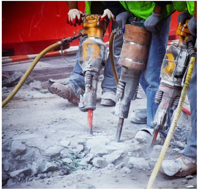
Description: Pneumatic Drill Quantity: 3no. Source: Own Condition: Very Good